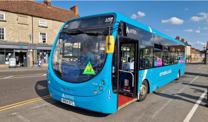
A Moorsbus M4 in Helmsley about to depart for Rievaulx Abbey and Guisborough in July 2023